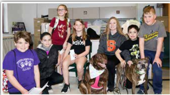
Hannibal Central School District students are all smiles as they join the Reading for Rescue dogs during Healthy Family Night.